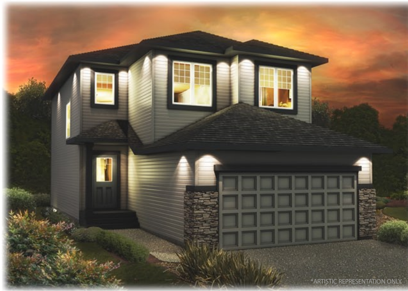
STANDARD ELEVATION WITH STONE UPGRADE