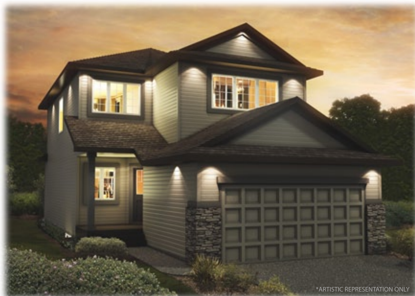
*ARTISTIC REPRESENTATION ONLY