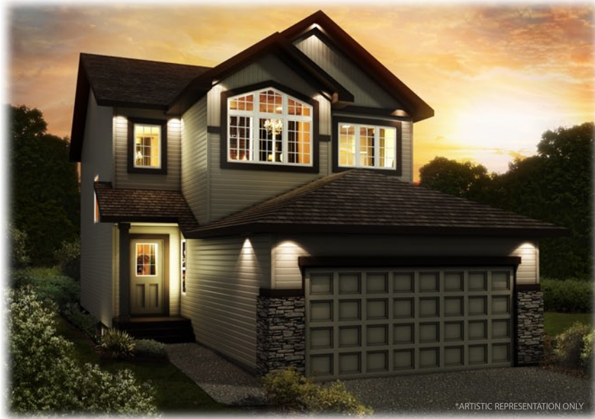
*ARTISTIC REPRESENTATION ONLY