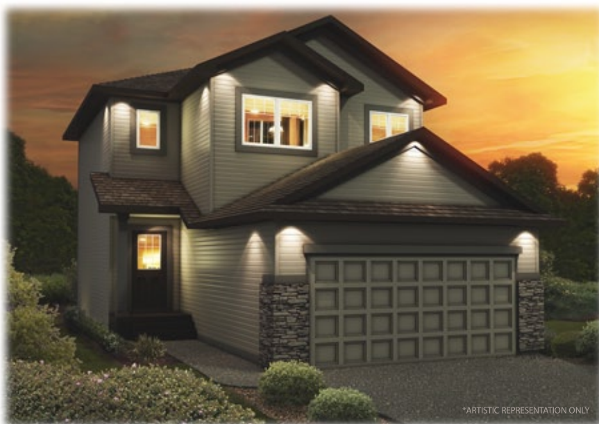
STANDARD ELEVATION WITH STONE UPGRADE