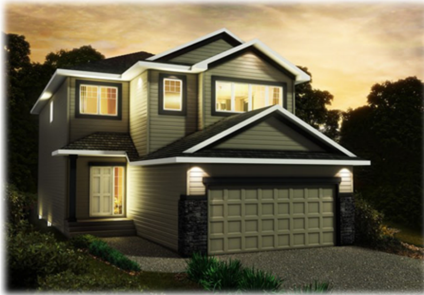
STANDARD ELEVATION WITH STONE UPGRADE