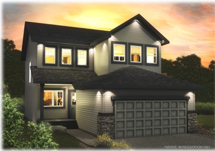
STANDARD ELEVATION WITH STONE UPGRADE